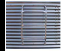
COMPETITION BRAND "W"