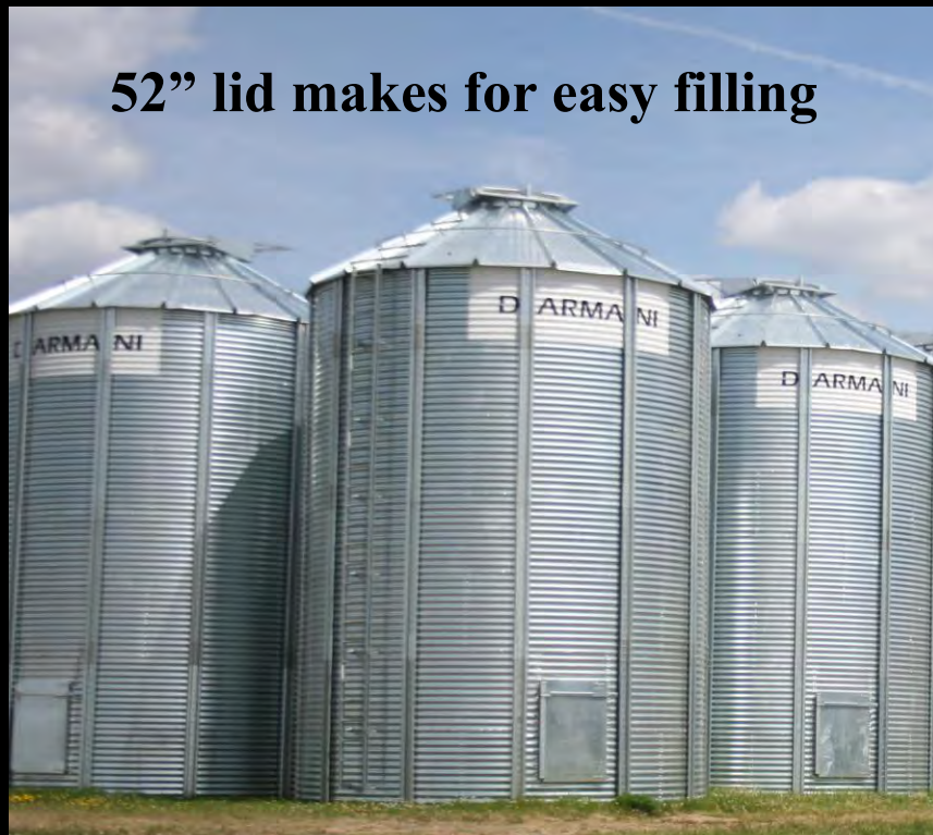
52" lid makes for easy filling

5,000-10,000 FLAT BOTTOM (non air) Packages