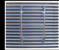
COMPETITION BRAND "W"